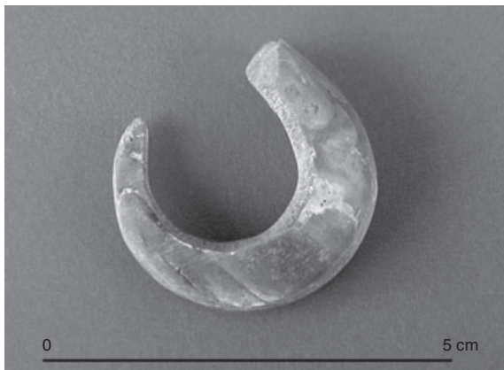
Fig. 3. Photo of the curved fish-hook with head missing (Akab, United Arab Emirates).

example with no head (Figs 2.5 and 3) and a small head with two eyelets for attachment. Two curves of fish-hooks and also several fragments of pearl oysters have many perforations caused by marine organisms. Certain P. margaritifera could simply have been collected on the shore rather than taken directly from the oyster banks.